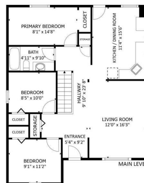
88 Castlebrook Rise NE - Calgary MAIN LEVEL: 1053 SqFt