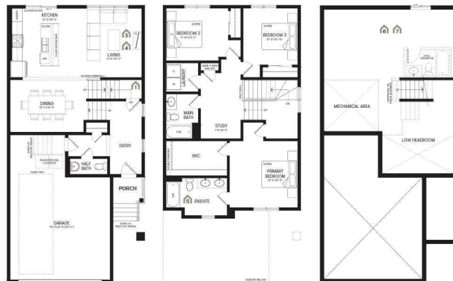
Main floor 757 sq ft.