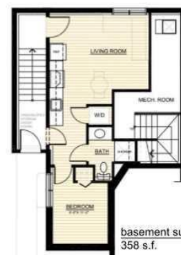
basement suite: 358 s.f.