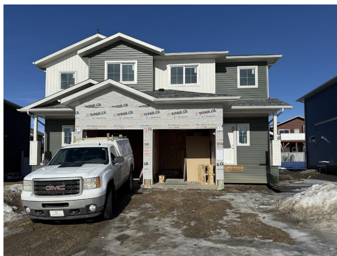
The Oxford II Duplex Unit with basement suite 1,337 s.f./ 1,316 s.f.